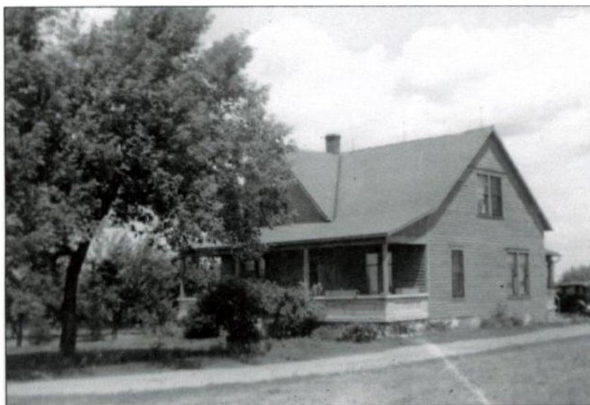
The DeGroot house in Wausaukee, WI