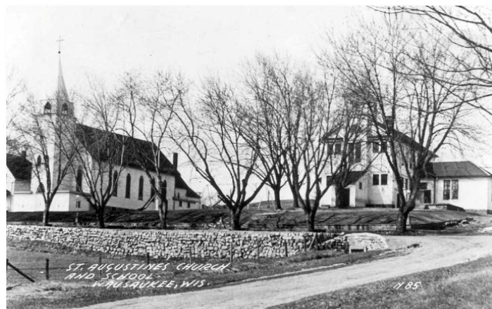
The St. Augustine's church and school in Wausaukee, WI