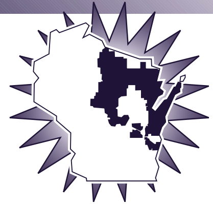
Empowering Successful Partnerships