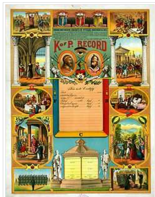
Knights of Pythias membership certificate, 1890. [1]